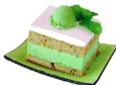
Our Famous Green Tea Ice Cream Cake

Prices are subject to change without notice.